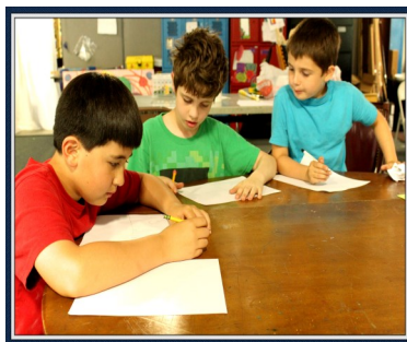
Club members, who might otherwise not receive it, get homework support