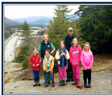
Your donation can bring new experiences to a child such as field trips to exciting area sites