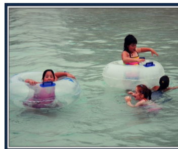
BGCNC Swim Program is open to all members, assuring children learn to swim regardless of income